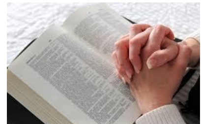
Our source and guide for truth: God’s Word with prayer.

“Let no man deceive you with vain words.” Eph 5:6