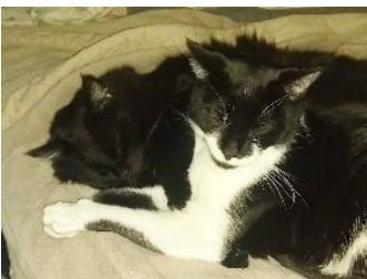
Cinders and Oreo

To help overcome your fear is to memorize verses on salvation. Practice sharing to a fellow believer. Go out with someone on church visitation. (It was on church visitation that I met my wife of 43 years.) Most important pray for a concern and loving attitude, courage, the right opportunity, and the words to say. God does not speak to man in an audible voice. That is why He needs yours.