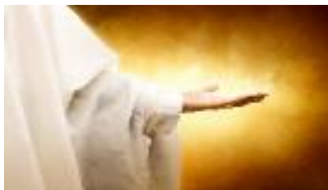
I have called you friends. John 15:15

If you do not have these types of relationships you are missing out. I cannot do anything for you about a grandchild but I can point you to the one who can be your Pappaw, your Father, your God, your Lord, your Savior, your Provider, your Listener and your Friend. “But as many as received Him, to them gave He power to become the sons of God, even to them that believe on his name.” John 1:12. He has His hand stretched out to you.