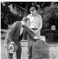
Tom & his tombstone.

The other night, I watched Season 1 Episode 8. It featured a man named Thomas Silby. He came to Andy. Andy looked at him as if he seen a ghost. Andy said that the last time he saw Tom was at Tom’s funeral. Tom’s wife had reported that while he has on a trip, he been run over by a train. They had a service and put up a gravestone for him. Tom laughed and replied that she made up the story to save face. She told him to leave because of his drinking and anger problems. However, he is back now a changed man. Andy showed him his tombstone and told him about the nice service. He then took him to his wife, who was surprised to see him. At the end of the show, Andy asked Tom how things were going. Tom said great. Andy asked him what should be done with his tombstone. Tom said leave it there. That old man is dead and buried. I am a changed man. No more drinking, cursing or anger.