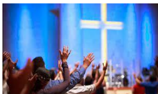
Are you just following?

Which do you visit the most in church, the coffee room, or the prayer room? Have you ever been in the prayer room? Would you go only to meet the Savior? Would you go if there was no praise band? Do you leave feeling good about yourself or broken about your sin and burdened for a lost world? Do you study, obey, and believe the Bible is the infallible Word of God? Do you continue in a sinful behavior or show the fruit of the Spirit? If the public were against Christians, would you identify yourself as one? Are you really born again or just following Christ? Don’t be self-deceived!