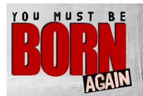
Are you Born Again?

I recently found a great video on salvation. I encourage every person to watch this it. It will reveal if you are Born Again. Are you saved or self-deceived?