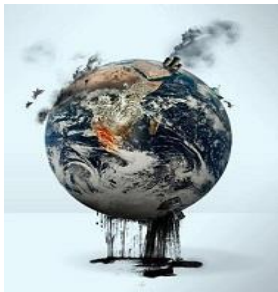
Is your power from the dying world?

When we become Christians, we have available to us a whole new power source. We can plug into this source through reading, studying, and memorizing the Bible. “Thy word have I hid in mine heart, that I might not sin against thee.” Ps 119:11 “Thy word is a lamp unto my feet, and a light unto my path.” PS 119:105 “This book of the law shall not depart out of thy mouth; but thou shalt meditate therein day and night, that thou mayest observe to do according to all that is written therein: for then thou shalt make thy way prosperous, and then thou shalt have good success.” Jos 11:8 “For the word of God is quick, and powerful, and sharper than any two edged sword, piercing even to the dividing asunder of soul and spirit, and of the joints and marrow, and is a discerner of the thoughts and intents of the heart.” Heb 4:12