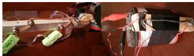
Electric powered eyeglass wipers. Order today!

If you are to let your light shine in this dark world, then you need more power than EverReady.