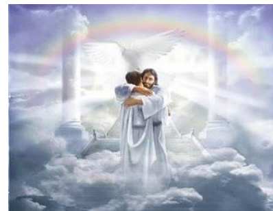
Does Jesus know your name?