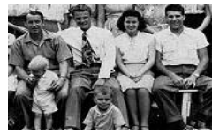
No one knew then how God would use him.