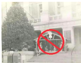
Old County Court House