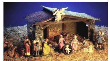
Is this still in your house?

"For unto you is born this day in the city of David a Saviour, which is Christ the Lord. And this shall be a sign unto you; Ye shall find the babe wrapped in swaddling clothes, lying in a manger." Luke 2:11,12