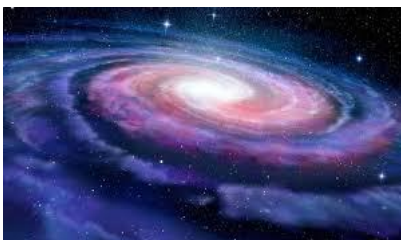
Space the final frontier.

“And they that be wise shall shine as the brightness of the firmament; and they that turn many to righteousness as the stars for ever and ever.” Daniel 12:3