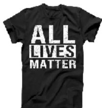
Ban from Walmart 5

Instead of protesting, let us sit down, discuss and enact solutions. Let us all pray and seek God’s face. Maybe then we can become “One Nation, under God, indivisible, with Liberty and Justice for all .”